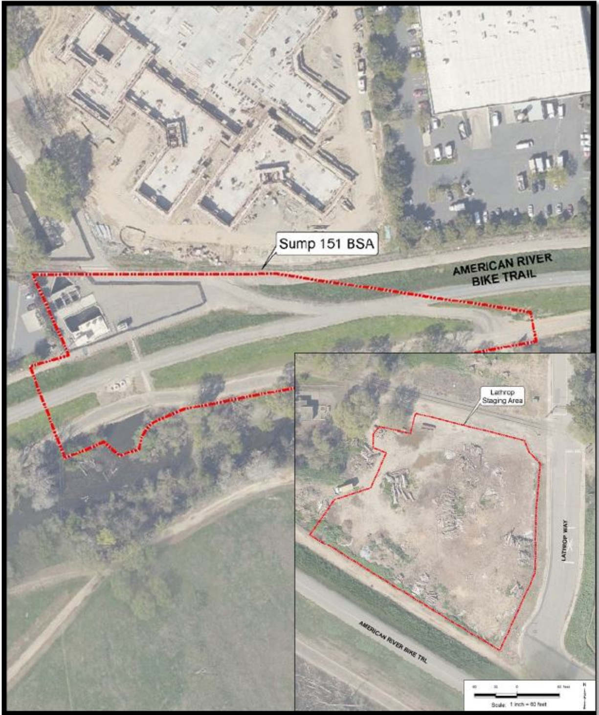
3) Approximate project footprint