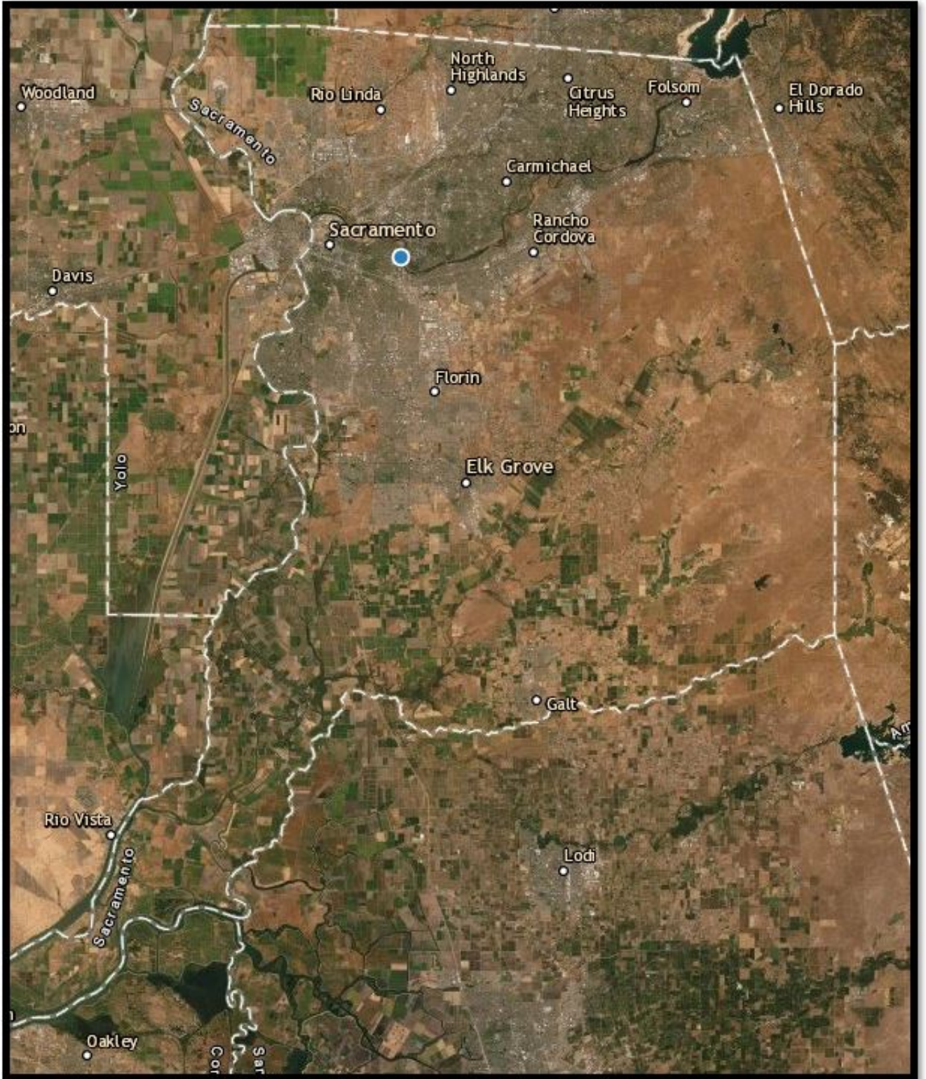
1) Vicinity map